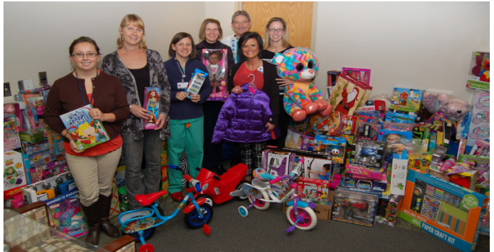
Medical and administrative staff at OhioHealth O'Bleness Hospital donated hundreds of toys and coats to the Santa Tree Project in 2014.