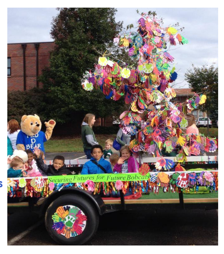
The ACCS float came in third place for the Ohio University Homecoming Parade. Volunteers from area elementary schools and OU helped "hand-paint" 1640 hands to represent the referrals of abuse and neglect ACCS received in 2013.