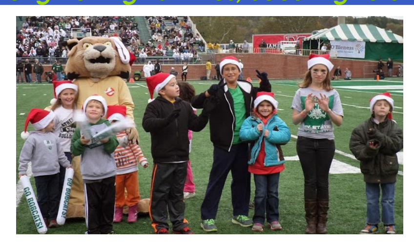
ACCS had the help of Rufus the Bobcat and some kid volunteers spreading the word about the Santa Tree Project at an Ohio University Football game.

After-hours or emergencies: Please call 1.877.477.0772