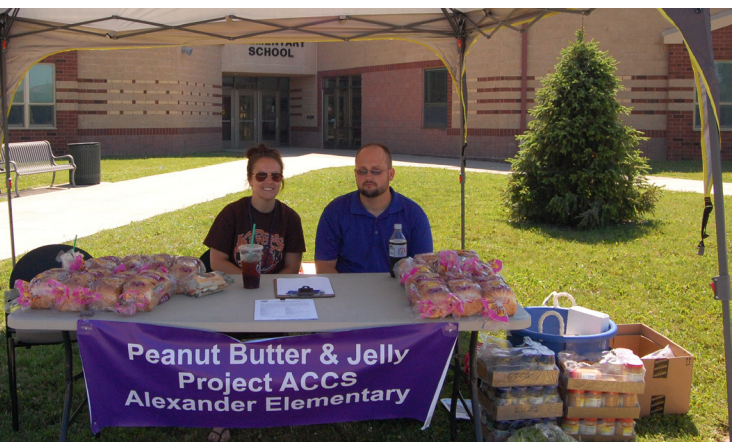
The ACCS PB&J Project helped hundreds of kids stay nourished throughout the summer with the weekly food distribution days.

The School Outreach team sponsored the 6th Annual Peanut Butter & Jelly Project to help keep children nourished through the summer months. In 2013, the PB&J Project served over 1000 children with weekly donations of bread and PB&J provided by the community. The project was funded largely by our community, who donated cash, peanut butter, and jelly to make this project possible.