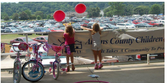
ACCS hosted games and activities at Kids Day at the Athens County Fair.

In 2013, SEORTC held 113 workshops attended by 1143 child welfare worker participants for a total of 823 training hours. Additionally, the Southeast Ohio Regional Training Center held 161 workshops for 2675 foster parents, for a total of 656 training