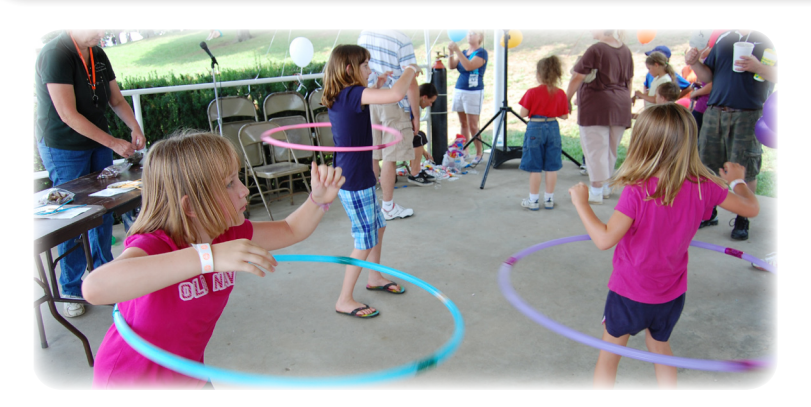
Hula hoop fun during Kids' Day at the Athens County Fair

This unit also houses our School Social Workers as part of our prevention programming. In 2009, the School Social Workers served an average of 33 families a month in the Federal Hocking and Trimble school districts. Also housed in the FSU was the Nelsonville Family Center, which provided many services to the Nelsonville community, including providing an average of 199 community members per month with a meal and donated clothing. The NFC became an independent agency in July 2009, and was renamed the Nelsonville Community Center to showcase its newly-expanded services.