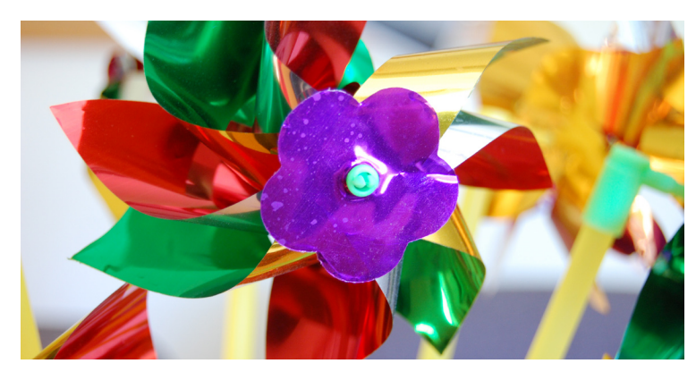
Pinwheels for Prevention kicked off Child Abuse Prevention Month in April.

This unit also houses our prevention programs, School Social Workers and the Nelsonville Family Center (NFC). School Social Workers seek to strengthen families and promote positive school relationships to enhance student success. In 2008, the School Social Workers served an average of 34 families a month in the Federal Hocking and Trimble school districts. The NFC provided many services to the Nelsonville community, including providing an average of 250 community members per month with a meal and donated clothing.