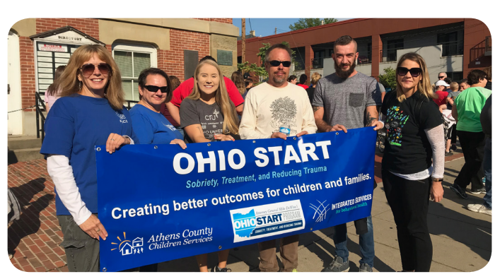
In September, ACCS staff and volunteers joined other county agencies and the recovery community in the 1st Annual Walk for Recovery, hosted by the Athens County Prosecutor's Office.