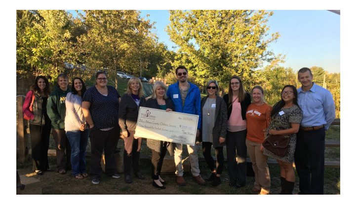
The Athens Professionals for Philanthropy once again hosted their annual PB&J 5K/10K to benefit the Peanut Butter & Jelly Project. ACCS joined in on the fun! The APP donated almost $4,000 to the PB&J Project in 2016.

300 + children received new tennis shoes at Lace Up For Kids