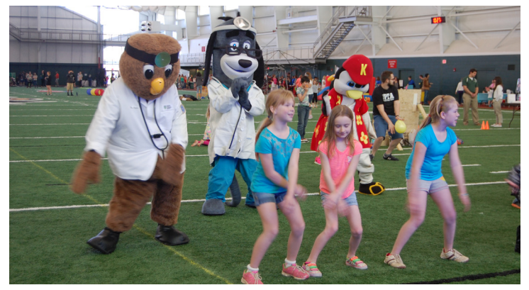
Children and families from all over Athens County gathered at the Walter Fieldhouse for the 29th annual Kidfest, held every year in April as part of child abuse prevention month.