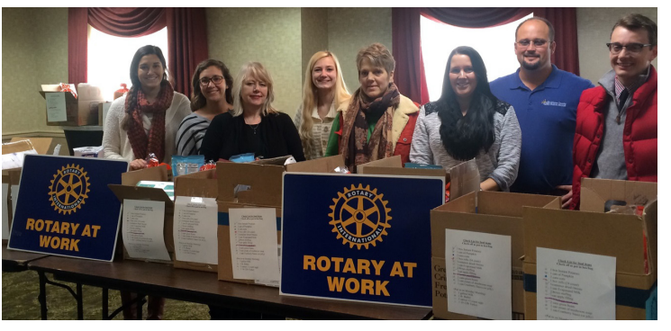
Rotary at Work. Every year the Athens Noon Rotary Club provides Thanksgiving "baskets", complete with turkey and all the trimmings for 50 of our local families.