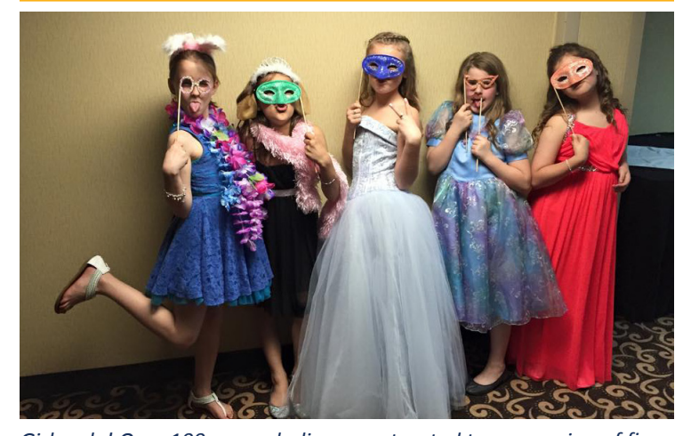
Girls rule! Over 100 young ladies were treated to an evening of fine dining and dancing at the Girl Power Etiquette Formal.