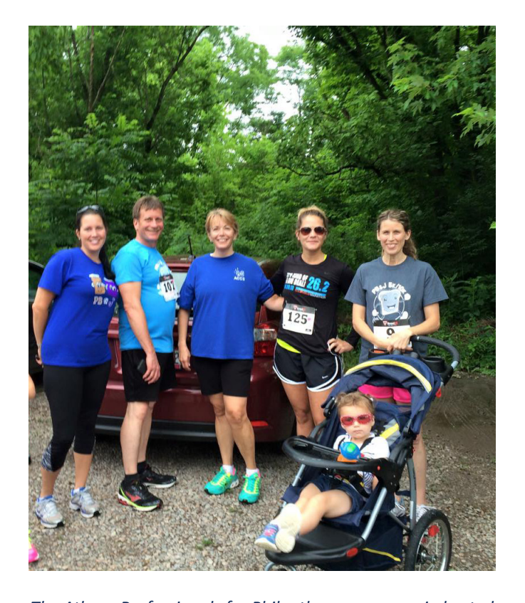
The Athens Professionals for Philanthropy once again hosted their annual PB&J 5K/10K to benefit the Peanut Butter & Jelly Project. ACCS joined in on the fun! The APP donated almost $5,000 to the PB&J Project in 2015.

500 + children received new tennis shoes at Lace Up For Kids