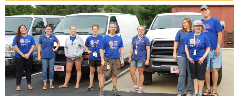
Peanut Butter Jelly Time! ACCS Staff, Interns and Volunteers getting ready for a busy day of distributing PB&J!