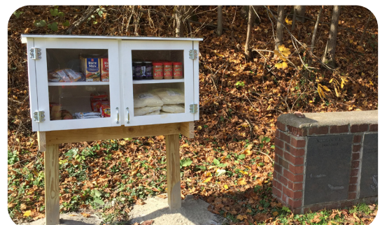
The Blessing Box Food Pantry that ACCS built and installed at the Carbondale Community Center.