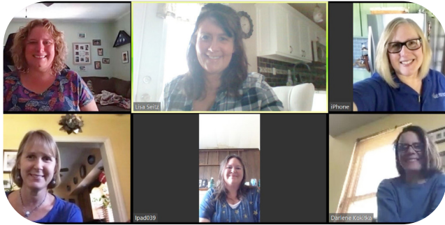
The Placement Team wore blue to their April virtual team meeting.

The ACCS Placement unit manages all child placement-related services. This includes recruiting, training, licensing, and maintaining a dedicated group of foster homes to care for children in agency custody. The agency continuously recruits new foster parents needed for sibling groups, children and youth of all ages in all Athens County school districts. Our Life Skills Caseworker is assigned to all school age foster youth to assure the best possible educational and independent living outcomes.