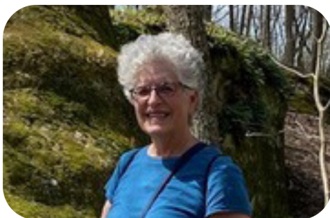
ACCS Board Chair WEARS BLUE for Child Abuse Prevention in April.

In 2019, Athens County voters approved a 2.5 mill, ten-year replacement property tax levy. Athens County Children Services staff and board greatly appreciate the continued support of the Athens community. The primary funding source for Athens County Children Services is that and a 3 mill ten-year property tax levy approved by the voters in 2015. These operating funds are vital for ACCS to be responsive to the ever-changing needs of the children and families of Athens County.