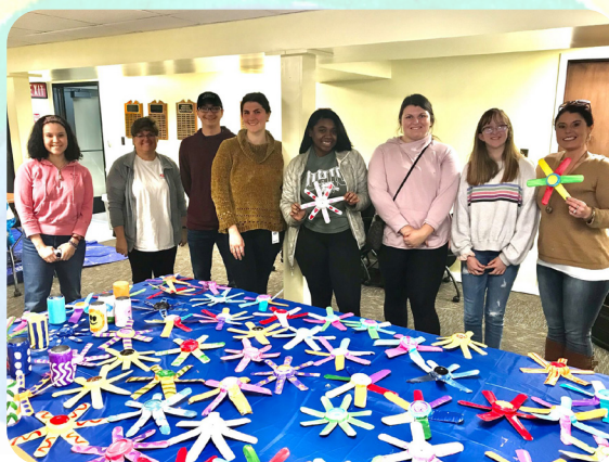
ACCS staff and volunteers met several times in January and February to prepare the hand-painted pinwheels we use in our annual Pinwheels for Prevention display in April. Our pinwheels are made from recycled soda cans.