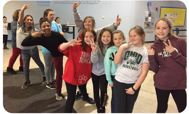
In January, the Trimble Girl Power girls were treated to a fun afternoon at Hocking College, where they got to test out some of the equipment in the Recreation Center!

local children received Santa Tree gifts