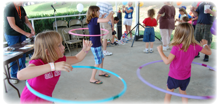
Hula hoop fun during Kids' Day at the Athens County Fair

This unit also houses our School Social Workers as part of our prevention programming. In 2009, the School Social Workers served an average of 33 families a month in the Federal Hocking and Trimble school districts. Also housed in the FSU was the Nelsonville Family Center, which provided many services to the Nelsonville community, including providing an average of 199 community members per month with a meal and donated clothing. The NFC became an independent agency in July 2009, and was renamed the Nelsonville Community Center to showcase its newly-expanded services.