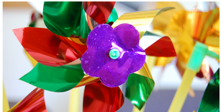
Pinwheels for Prevention kicked off Child Abuse Prevention Month in April.

This unit also houses our prevention programs, School Social Workers and the Nelsonville Family Center (NFC). School Social Workers seek to strengthen families and promote positive school relationships to enhance student success. In 2008, the School Social Workers served an average of 34 families a month in the Federal Hocking and Trimble school districts. The NFC provided many services to the Nelsonville community, including providing an average of 250 community members per month with a meal and donated clothing.