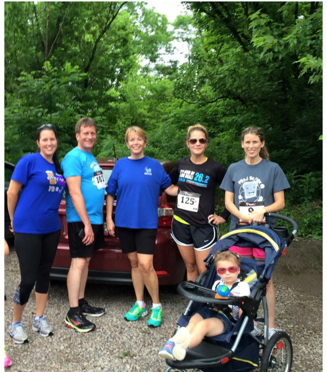
The Athens Professionals for Philanthropy once again hosted their annual PB&J 5K/10K to benefit the Peanut Butter & Jelly Project. ACCS joined in on the fun! The APP donated almost $5,000 to the PB&J Project in 2015.

500 + children received new tennis shoes at Lace Up For Kids