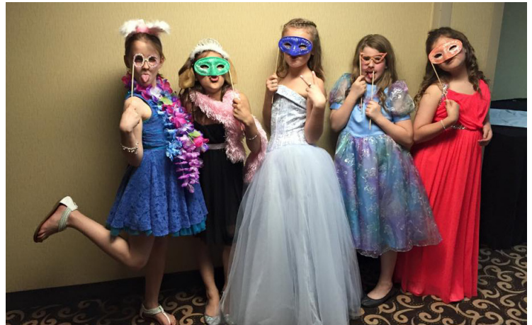
Girls rule! Over 100 young ladies were treated to an evening of fine dining and dancing at the Girl Power Etiquette Formal.