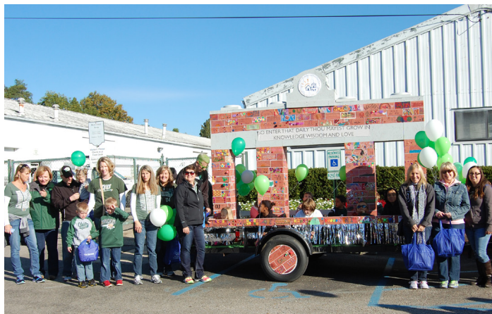
The ACCS float came in 2nd place for the Ohio University Homecoming Parade. The theme was "Same Bricks, Different Stories", and we had volunteers, staff, and community members make "bricks" that help tell the stories of the children we've been serving on these same Athens County bricks since 1948.

After-hours or emergencies: Please call 1.877.477.0772