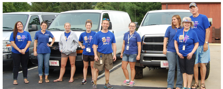
Peanut Butter Jelly Time! ACCS Staff, Interns and Volunteers getting ready for a busy day of distributing PB&J!