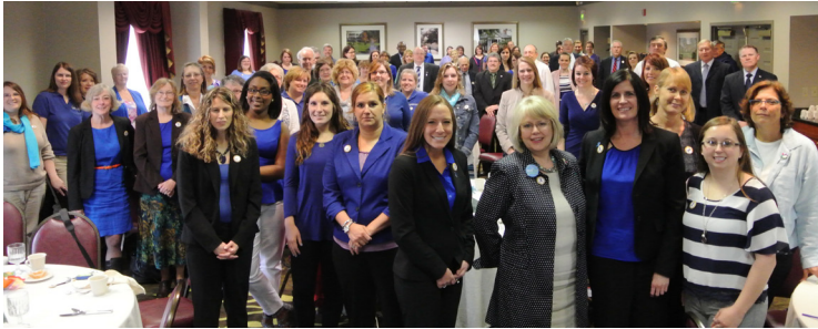
The Athens County Child Advocacy Center, the CASA/GAL Program, and ACCS collaborated to host the Champions for Children Breakfast on WEAR BLUE DAY in 2015.